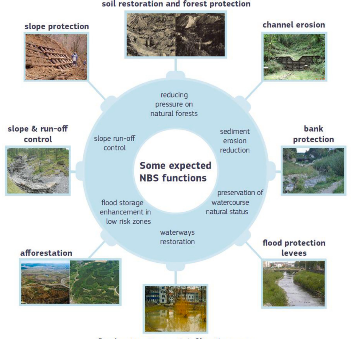
flood water storage & infiltration areas

SWB implies using plants not only for their technical functions, in terms of stabilization properties and erosion protection, but also for their multiple purposes, including ecological functions, through the development of plant communities, carbon storage and habitat protection. Hence, SWB fulfils a significant function for the ecosystem in which it is inserted, recovering ecosystem services of public interest (Santolini